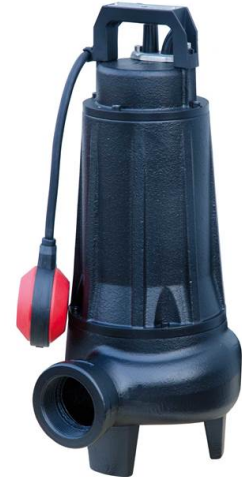
Attention: pictures for illustrative purposes

Tolerance according to ISO 9906:2012 3B2